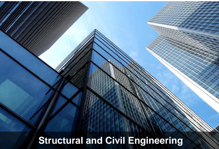
Structural and Civil Engineering

PREVIEW OF FUTURE TIME CONSTRUCTION PROCESS AND CORRECTION OF ERRORS IN THE PLANNING PHASE